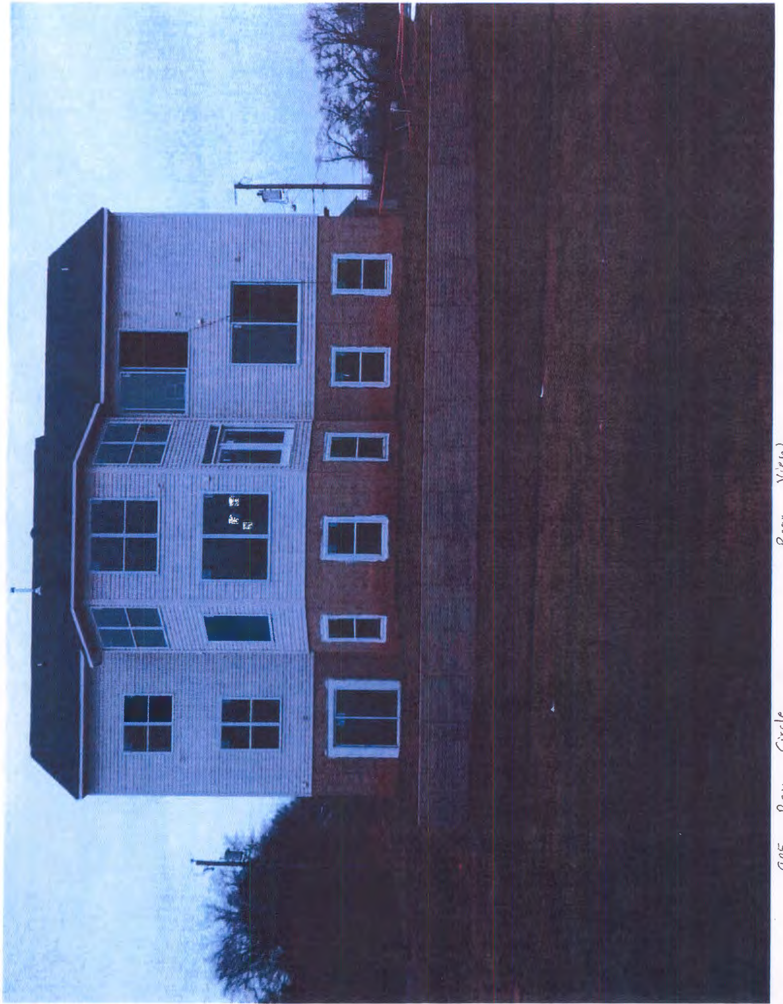
905 Bay Circle