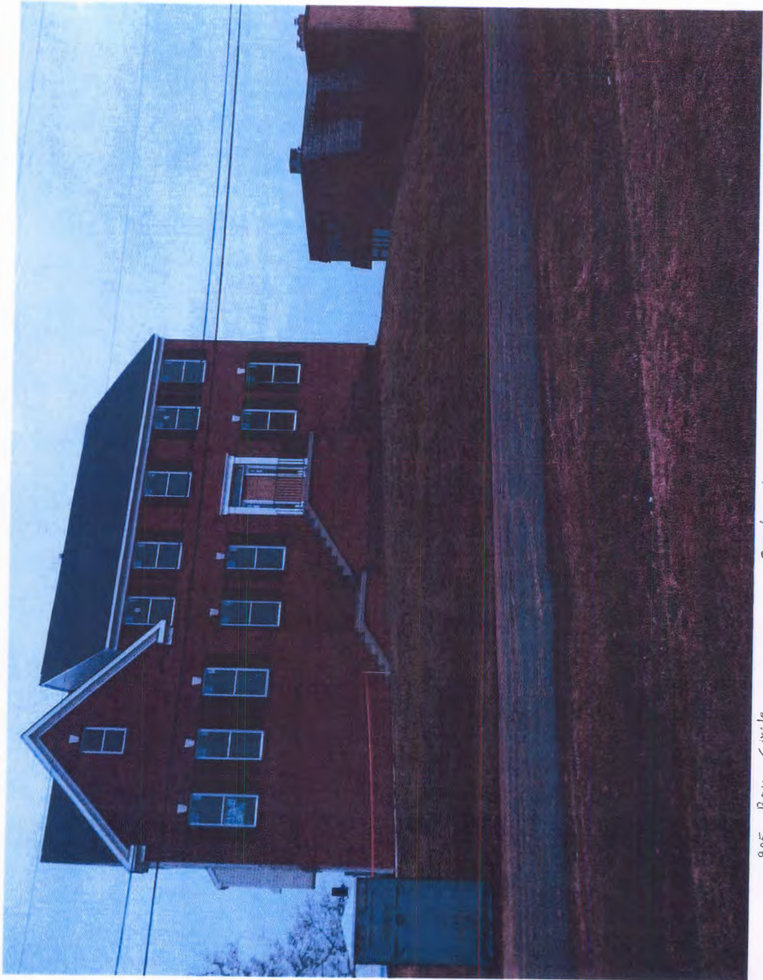
905 Bay Circle